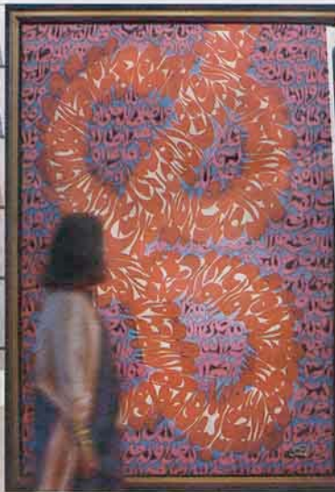
DAL+ASB+LAM by Iranian artist Charles Hossein Zenderoudi (1937)