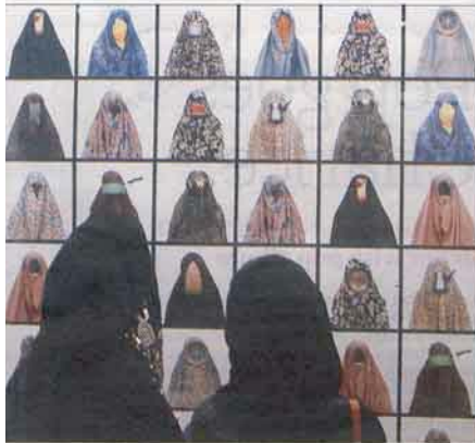
Like Everyday piece by Iranian artist Shadi Ghadirian