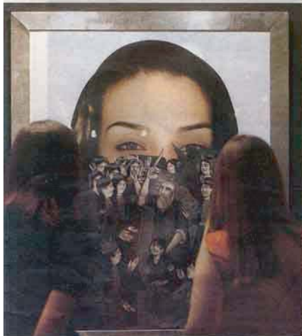
'The Loss Of Our Identity #6' by Iranian artist Sadegh Tirafkan