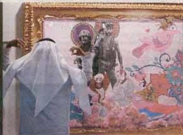
Painting by Lebanese artist Zena al-Khalil